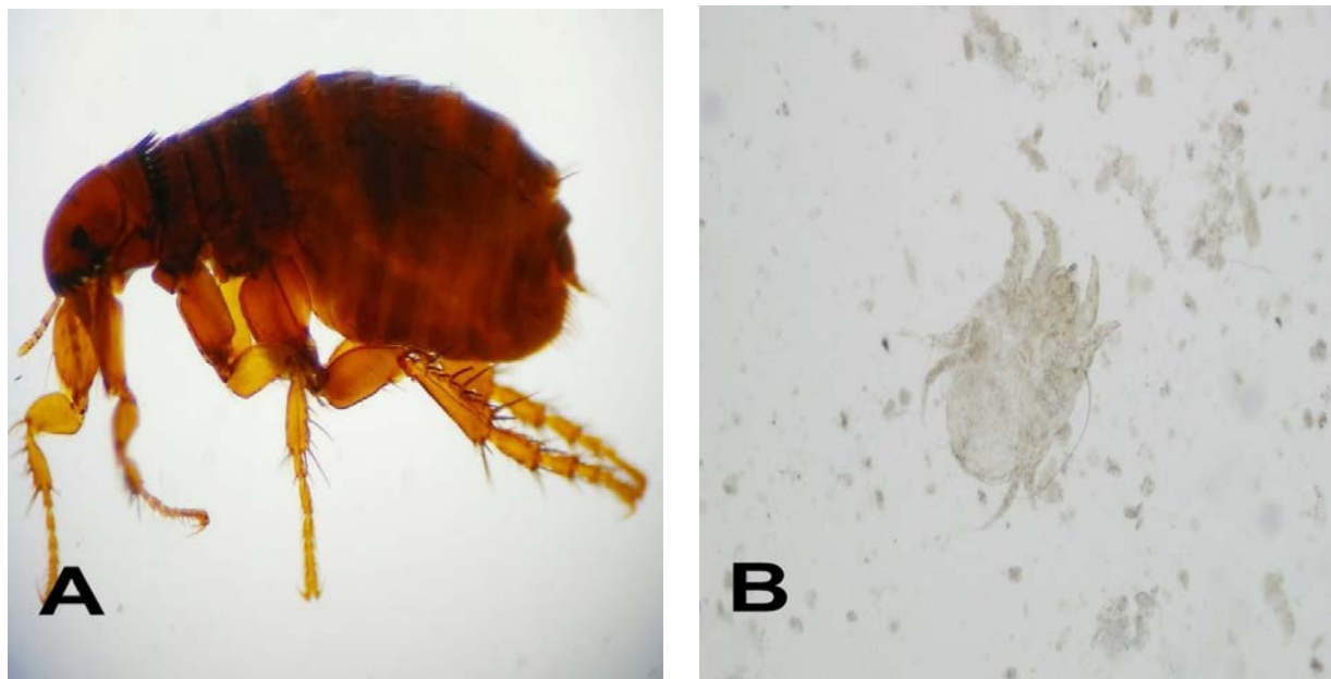
Figure 4. Other species of ectoparasites identified on small ruminants in Kelantan. A, Ctenocephalides spp.; B, Sarcoptes spp.