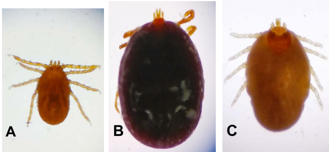
Figure 3. Genus of tick identified from small ruminants in Kelantan. A, Haemaphysalis spp.; B, Boophilus spp.; C, Rhipicephalus spp.